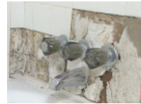
with a leaky tub ...