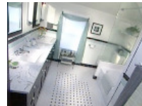
is converted into an Art Deco delight that gives the rest of the house a new lift.